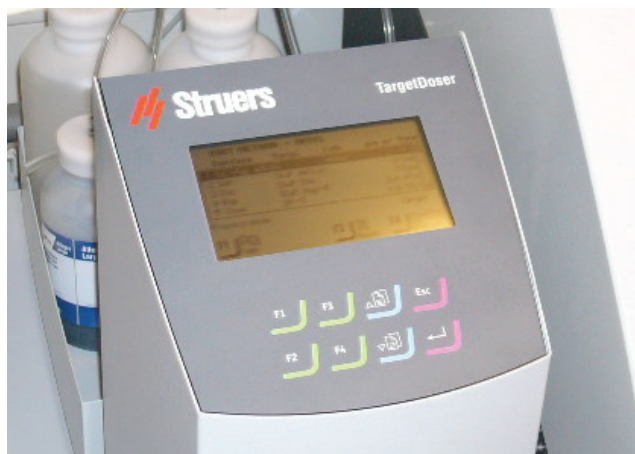
Automatic grinding & polishing unit set-up

DELTA Venlighedsvej 4 2970 Hørsholm Denmark Tel. +45 72 19 40 00 asic@delta.dk asic.madebydelta.com